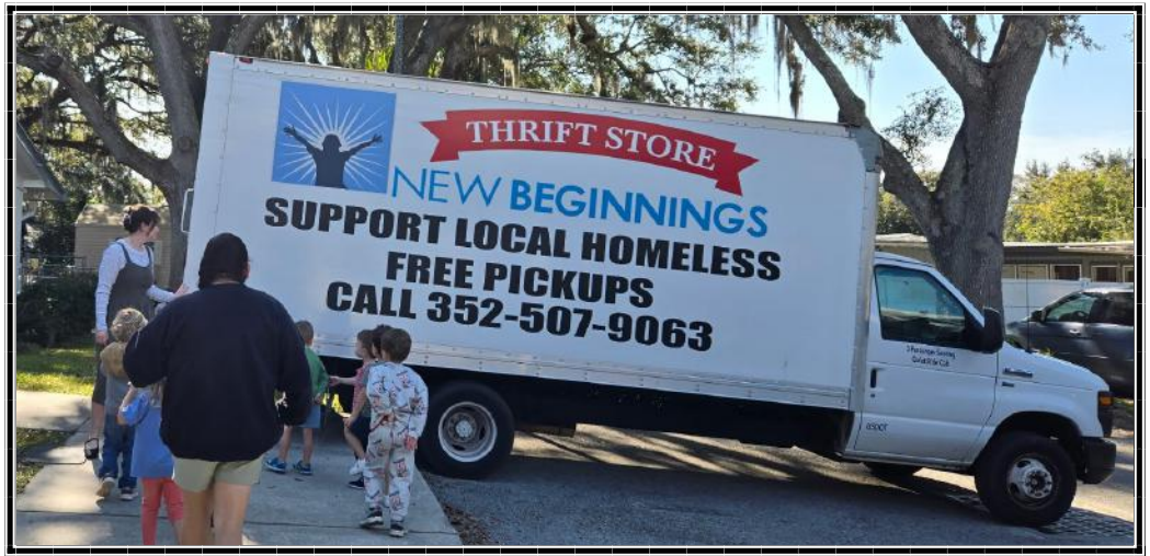
The Preschool families donated items that filled the New Beginnings truck.